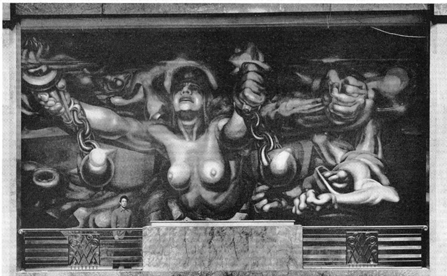
David Alfaro Siqueiros: DEMOCRACY BREAKING THE CHAINS OF FASCISM, cellulose paint on celotex, 1944, Palacio de Bellas Artes, Mexico City. In this building "Los tres Grandes" scream at the top of their lungs to see which can outshout the others.