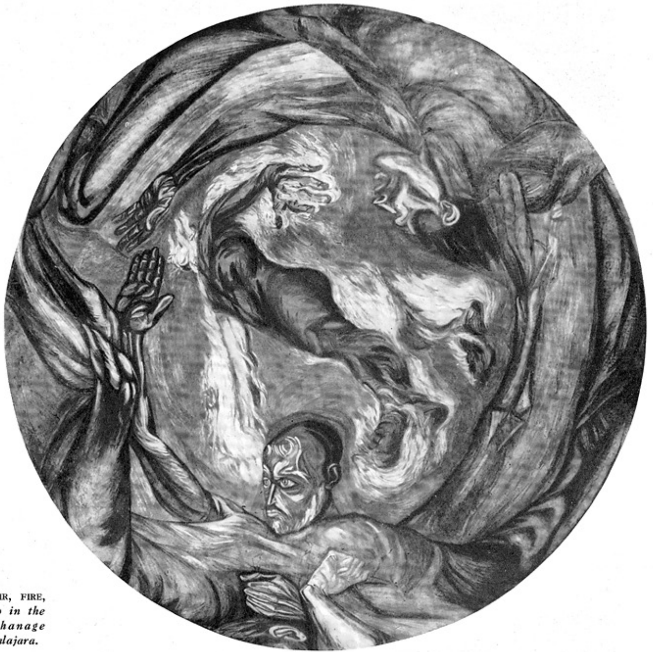
Orozcó: EARTH, AIR, FIRE, WATER, 1938. Fresco in the dome of the Orphanage (Hospice) of Guadalajara.

Palace, and, with a caution born of previous mishaps with buildings that split apart and patrons in revolt, chose to do true fresco on false walls. The mortar is trowelled into shallow metal troughs, half sunk into the wall, but movable if the need arises. As they fail to fit the scalloped outline of the door frames, the panels, despite the compositional care of the painter, suggest a show of easel pictures, beautiful ones, huge and heavy ones certainly. The main drawback is that this precaution opens the way for the future removal of the frescoes from the walls, and their eventual disposition, shorn of their natural habitat, in a mere museum.