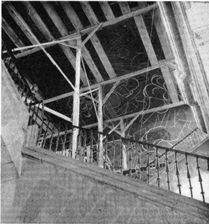
Siqueiros: Work in progress in the Treasury Building, Mexico City. The scaffolding with its widely placed planks affords two advantages: "It allows the daylight to filter in from under, and keeps out chicken-hearted admirers after their first visit."