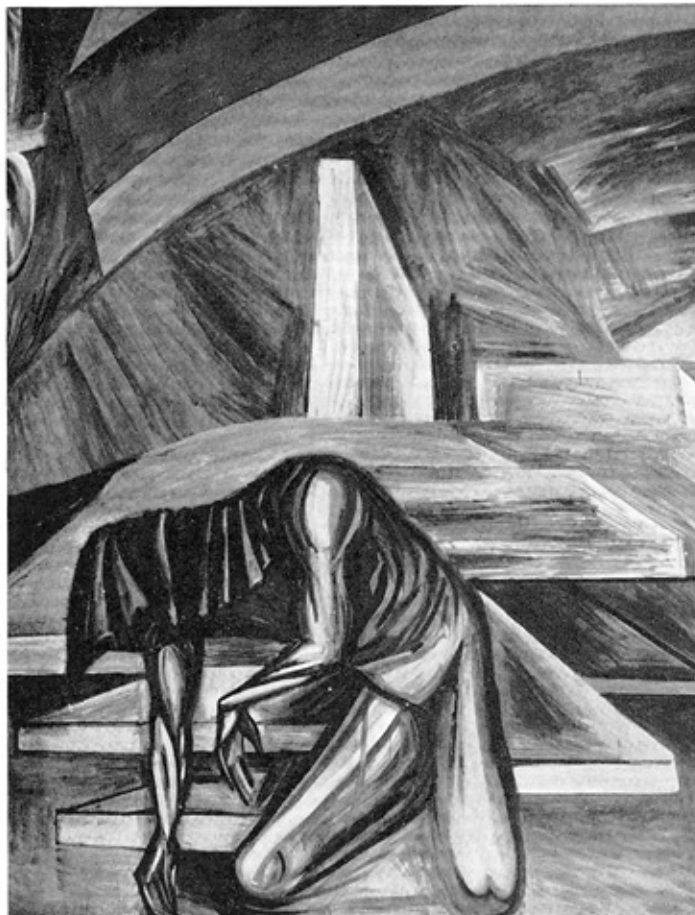
Jose Clemente Orozco: VISION OF THE APOCALYPSE (detail), fresco, 1944, Church of Jesus, Mexico City. "Shrouded and desperate forms."

plain defacers. A crop of scratched-in swastikas answers the painted crop of red stars; jokes of the privy type thrive on nude allegories.