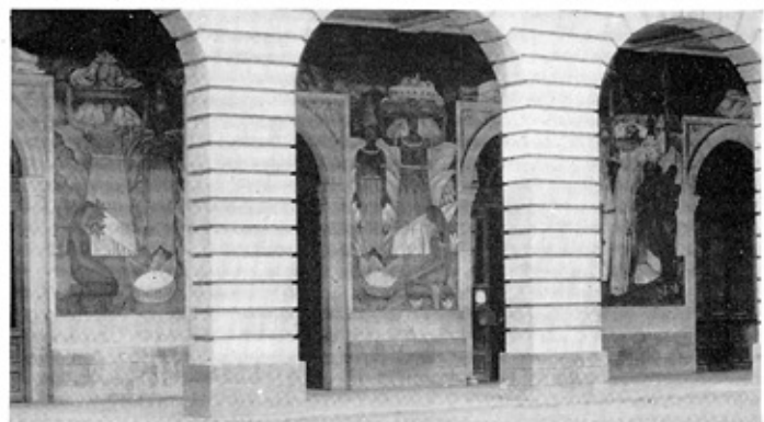
Rivera: PREHISPANIC MARKET OF TLATELOLCO (detail), fresco panel, 1945. National Palace. Data from recent excavations.