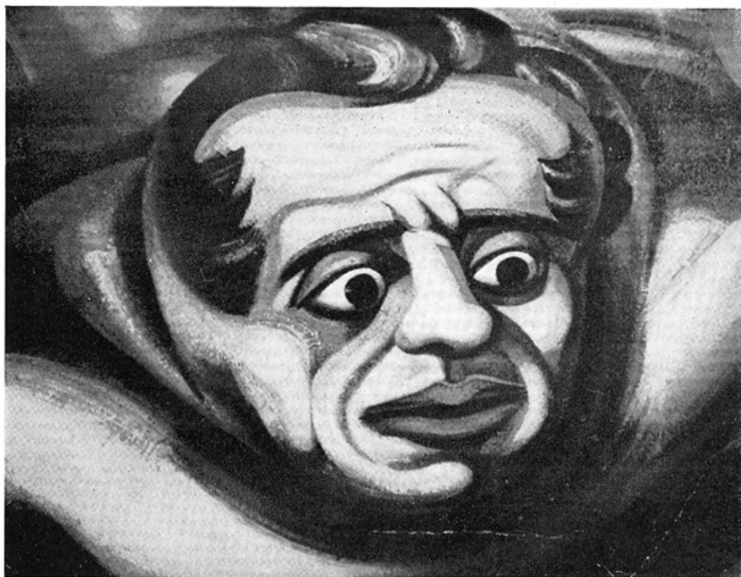
David Alfaro Siqueiros: EL DICTADOR SANTA-ANNA, detail of unfinished mural.

immobile onlooker, and murals though immobile, attract a spectator in motion. Thus, the idea that the mural is serf to architecture is replaced by that of the mural as a dynamic unit that forcefully provides itself with room in its otherwise inert habitat.